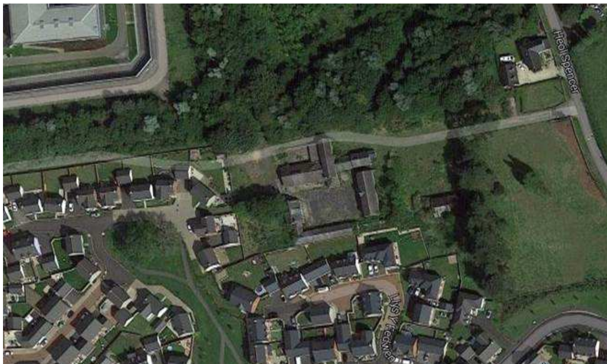
Fig. 2: Aerial Photograph