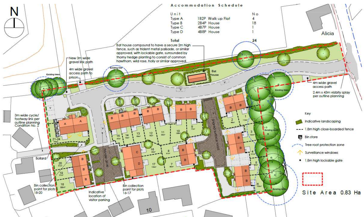
Fig. 1: Site Layout Plan

The proposed 24 residential units will comprise three house types including 18x2 bedroomed houses, 2x4 bedroomed houses and 4x1 bedroomed flats.