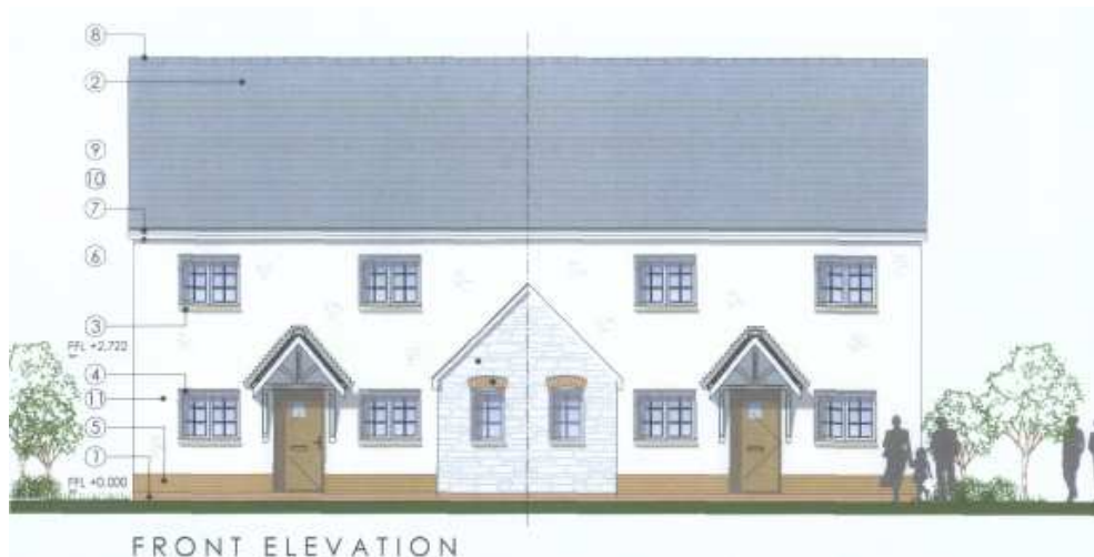
Fig. 3 - House Type Accommodating Flats

Many of the objectors have expressed concern about the introduction of flats as part of the submitted layout. From the extract plan below (Figure 2), it is noted that the 1 bedroom accommodation will be within a pair of semi-detached units which has a form, proportion and appearance that is in keeping with the housing proposed as part of this application. The house type will not detract from the character of its immediate surroundings or the wider area.